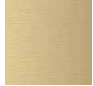
Brushed Brass SR222BB